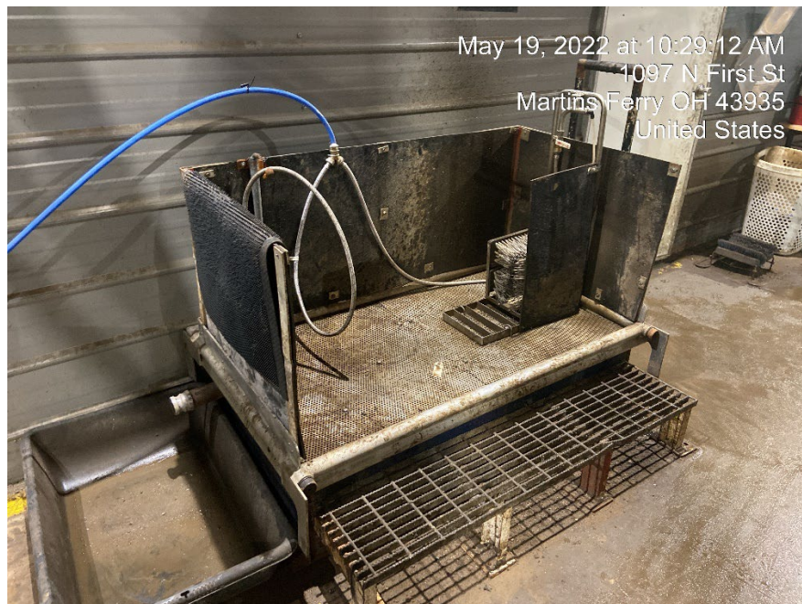
Boot Washing Station