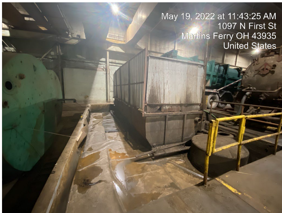
Cold Mixing Pit Sideview